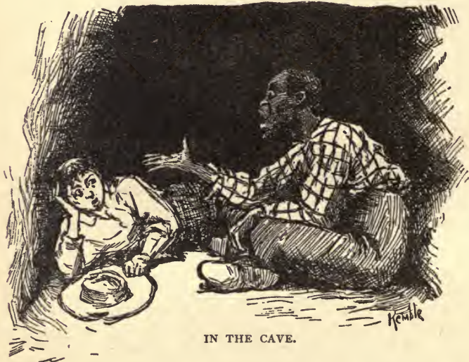
IN THE CAVE.

Special edition of the above books, fully illustrated and handsomely bound, sold separately: